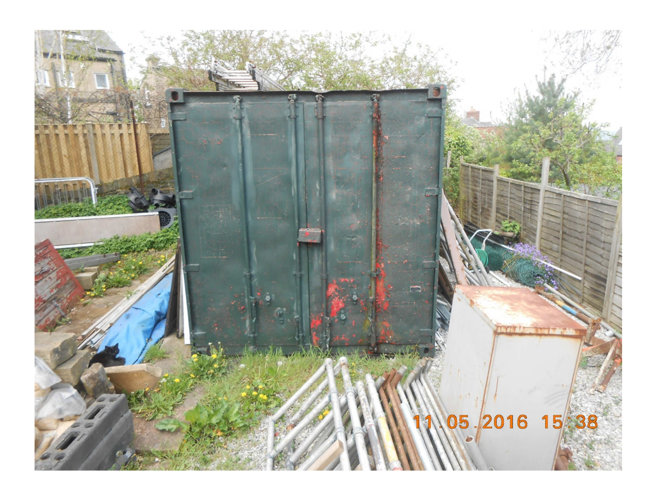
Within site accessible to residents